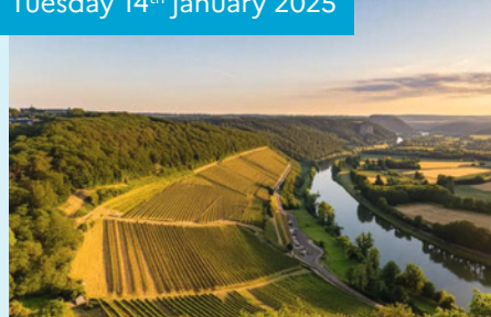
Wineyard Investment Day