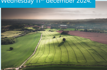
Private LuxAA event